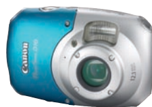
Waterproof digital camera, Canon , $330.