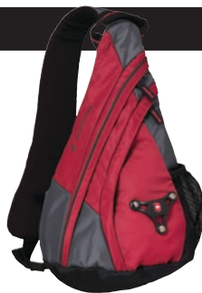
Nylon backpack, Victorinox , $65.