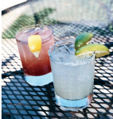
Raspberry lemonade and a margarita at Healdsburg Bar & Grill, in Sonoma County.

Ask for this Campari-laced Italian aperitif here and it will come garnished with an orange and lemon twist. The combination is enjoyed on a plush couch overlooking the