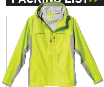
Waterproof jacket, The North Face , $179.