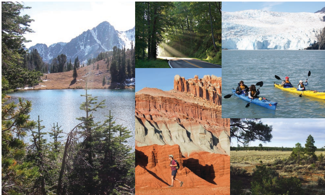
Outward Bound Clockwise from above left: Yellowstone's Hilgard Lake; "Tail of the Dragon" road, in the Great Smokies; kayakers on Aialik Bay, in Kenai Fjords; the site of the Grand Canyon's new private camp; hiking through Capitol Reef's badlands.

served as the backdrop for dozens of westerns, but it remains largely unexplored. Enter REI (800/622-2236; rei.com; seven-day trips from $1,799 per person), which has just launched a trip that takes you from the dramatic domes lining Waterpocket Fold, a 100-mile scar in the earth's crust, to Cassidy Arch, and, adjacent to the park, the five stacked sandstone terraces that form the Grand Staircase National Monument.