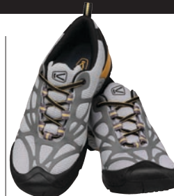
Motion-stabilizing hiking shoe, Keen , $110.