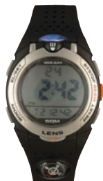
Watch with compass and flashlight, iBeam , $59.